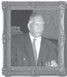
General Deshamanya Denis Perera 1987 - 1990